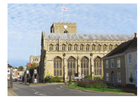
St Mary's Church and Norman Tower