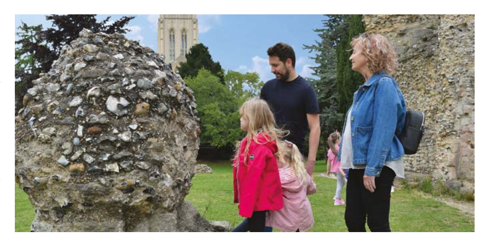
Visitors to the Abbey

The Abbey has a long Christian heritage. We will explain the Rule of St Benedict that governed the Abbey and the ancient traditions of national and international pilgrimage. We will describe the Dissolution of the Abbey by Henry VIII in 1539 and chart the growth of the local Christian Church in Bury St Edmunds in the centuries that followed.