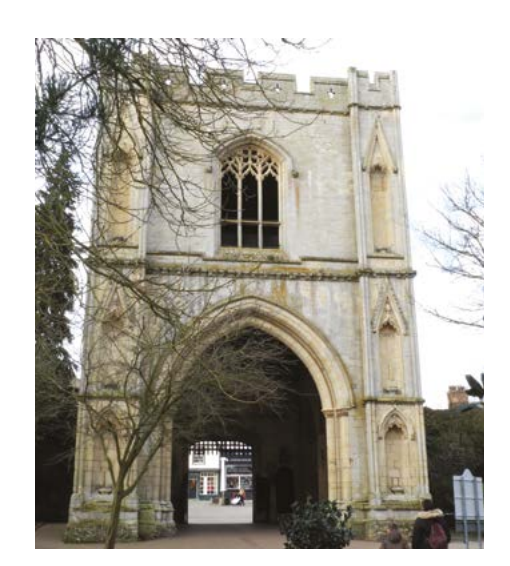
Abbey Gate