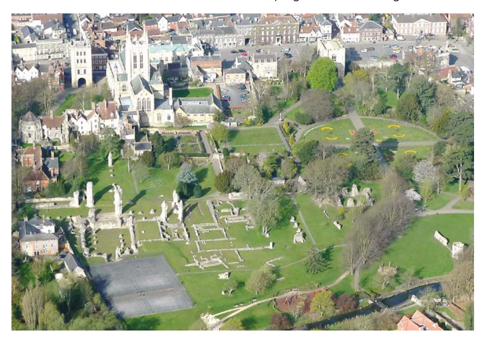
Aerial view of the Abbey of St Edmund Photo reproduced with permission, 2015

Our future work will develop the present Draft Action Programme which was worked up from the Heritage Assessment and the Conservation Plan. We will implement a public and private sector fundraising strategy and we will secure best value in commissioning projects. We will then progress project management and programme monitoring and review.