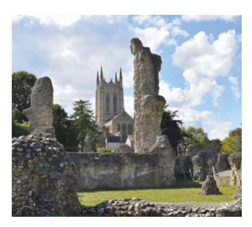
Abbey and Cathedral

The Abbey of St Edmund lies at the heart of Bury St Edmunds. It binds together St Edmund, the first Patron Saint of England, and Magna Carta. We will tell the story of their roles in national and international history.