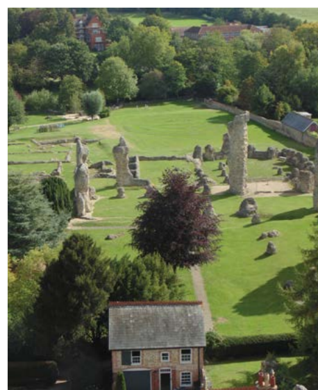
Abbey Ruins from Cathedral Tower

And finally, we will help to tackle climate change and coordinate environmental conservation through the Local Plan and through our work with the heritage agencies. We will highlight key views into and out of the area and identify key historic buildings and routes.