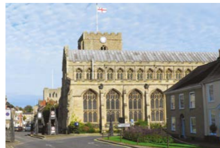
St Mary's Church and Norman Tower

We will carefully develop this Overarching Plan into more specific plans and projects. This will include how we fund and deliver a programme of projects in stages during the next ten years. We are aligning our plans with the