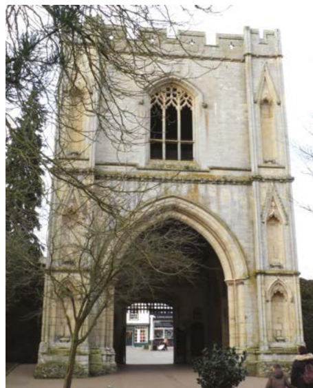
Abbey Gate