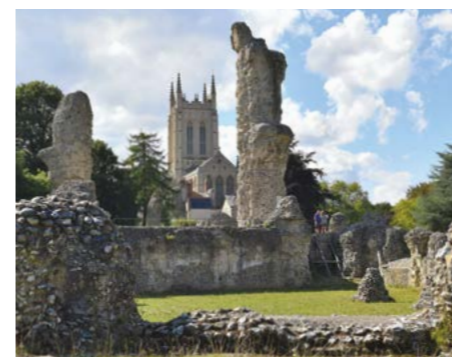
Abbey and Cathedral

The Abbey of St Edmund lies at the heart of Bury St Edmunds. It links the stories of St Edmund, the first Patron Saint of England, and Magna Carta. We will explain the national and international roles of the Abbey area and its relationships with the town throughout its long history.