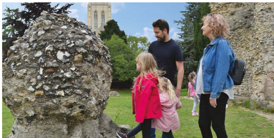
Visitors to the Abbey

The Abbey area has deep spiritual significance and we will welcome visitors of all faiths and none. We will explore the beliefs of pre-Christian settlers and the growth of Christian settlement in the River Lark valley.